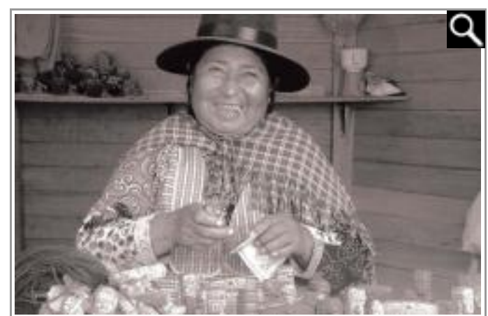
Indigenous vendor at Tiwanuka

In Bolivia's political and economic capital, La Paz, sparkling new 10-seater cable car gondolas, called telefericos, transport riders thousands of feet up from the city's center in the valley, past breathtaking views of Illimani mountain and surroundings, to distant, elevated parts of the city and the neighboring El Alto.